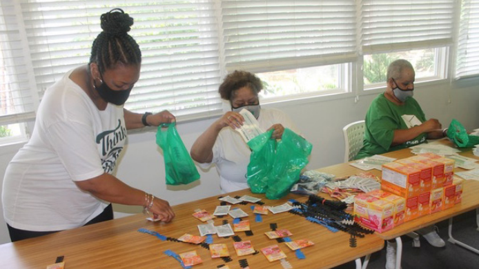
Green Box Solutions Corona Kit Volunteer event