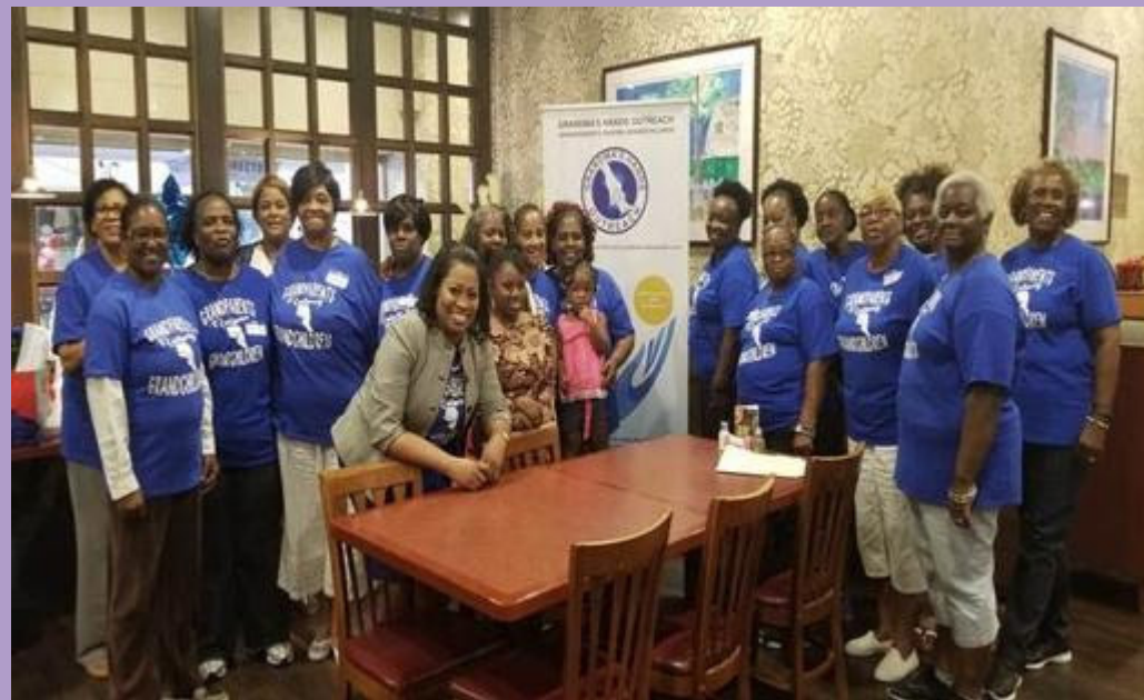
Grandma's Hands Outreach, 4th grandparents appreciation luncheon

FSC is unusual in that it awards grants to community organizations that are working to address the systems and structures that cause community problems. Often, traditional charities and private foundations overlook these organizations because their projects are considered too new, the organization too small, or their objectives are too controversial. The Fund is willing to make grants to these groups and organizations because we believe that communities working on their own behalf are powerful forces for change.