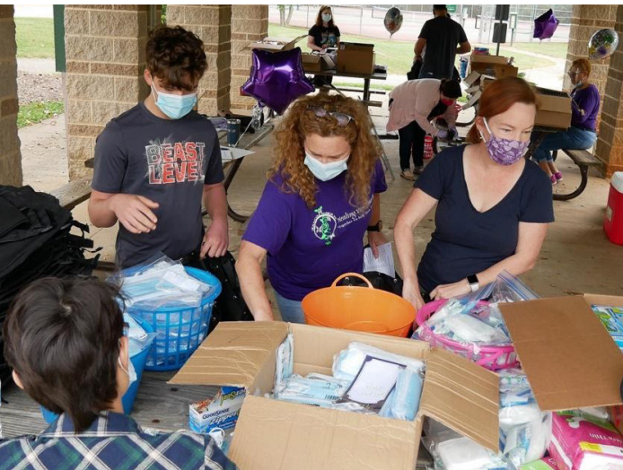
Healing Vine Harbor, Healing Bag project