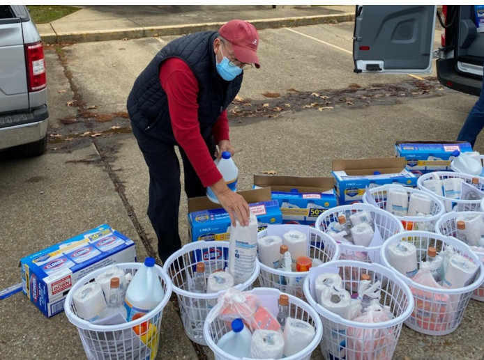
Children of the Village Network, Inc.